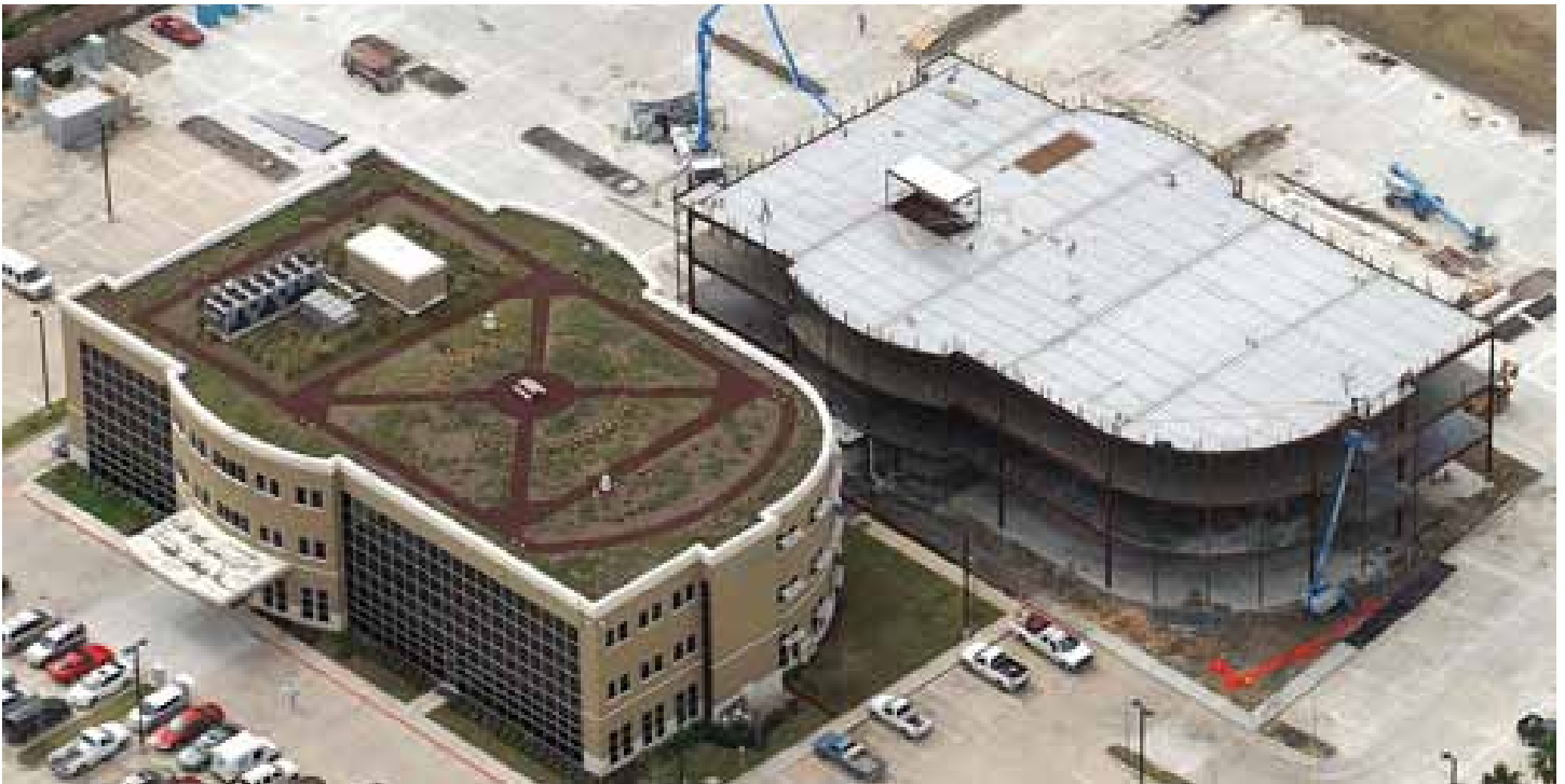
Yes, that really is grass on the roof! Showing off the latest green building technologies at 251 Medical Center and the construction of her sister building, 253 Medical Center.