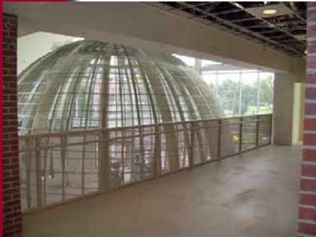
New Planetarium, CM@R project at University of Nebraska-Kearney, Kearney, Nebraska

The other major advantage of CM@R is scheduling. Many projects have an extremely tight time frame. Using CM@R, the contractor is engaged and early mobilization and construction activities are able to proceed concurrent with completion of the design. Under a traditional design-bid-build contract, construction cannot begin until after the design documents are completed.