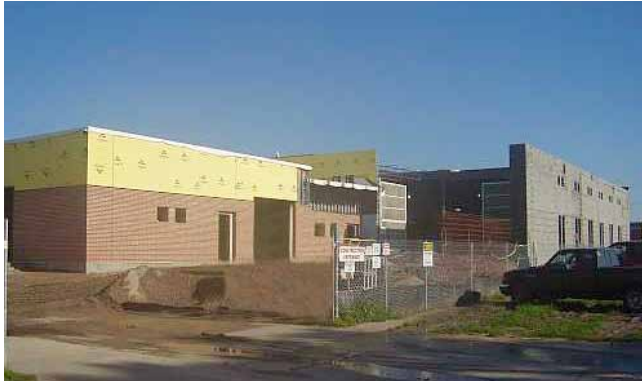
New Detention Center, CM@R project at Buffalo County Courthouse, Kearney, Nebraska.