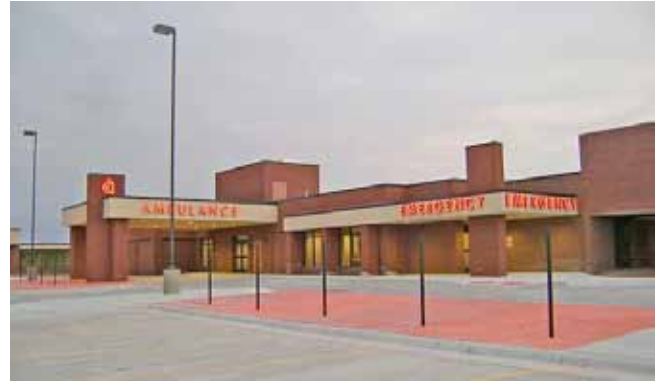
New Emergency Entry, CM@R project at Tri-County Hospital, Lexington, Nebraska.