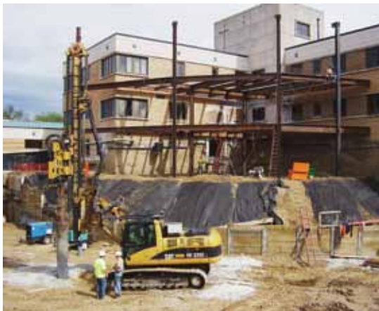
At left: Steel going up for St. Francis Memorial Hospital's new addition.

When completed, the project will create a new entry canopy, healing garden and three-level patient addition. The partial lower level will house the mechanical and electrical equipment. The first level will include a new entry lobby and rehabilitation area, along with remodeling work on the clinic. On the second level, a new cafeteria and conference space will be added, and the third level will include 17 new patient rooms with support space, plus the existing patient room wing will be transformed into seven new patient rooms with nursery. Project completion is anticipated in March 2012.