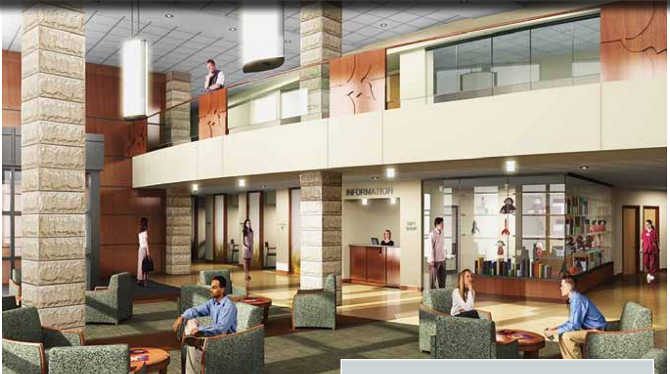
A computer rendering of the new entry lobby at St. Francis Memorial Hospital. Right: A look at the future the new entry canopy at St. Francis Memorial Hospital.