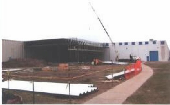
Steel erection in progress.