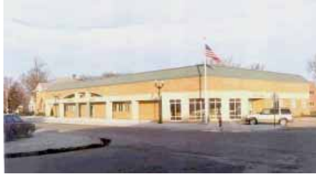
City of Madison Office/Museum/Library

Office/Museum/Library Behlen Building Systems - 1988 Building of the Year 1st Place Award - Institutional Category