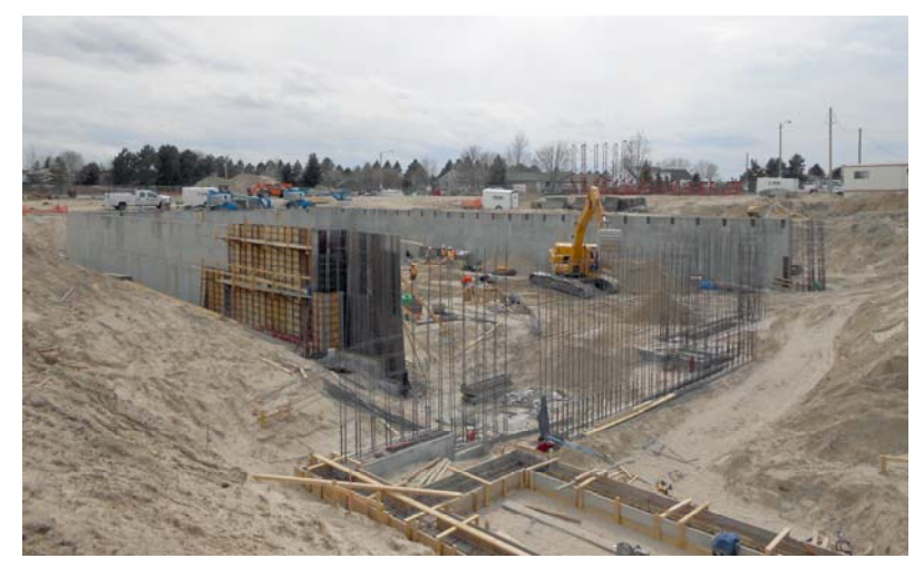
2014 Jobsite progress: Upper left, January 28; Upper