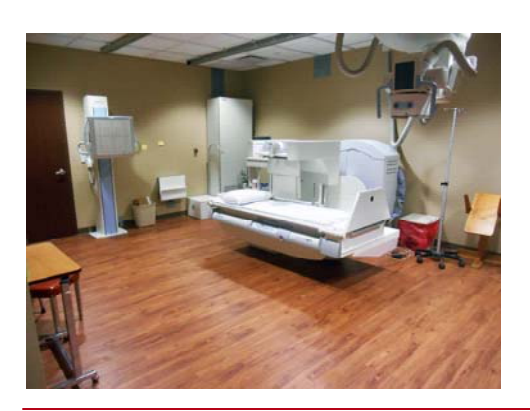
Left: New X-Ray Dept., Center: New private patient room, Right: New Front Lobby

This summer, the hospital sold pink shirts to honor a fellow staff member and in recognition for Relay for Life. Our employees on site got involved and even participated in their pink ribbon photo. A big thank you to the guys in the field for supporting the communities they work in.