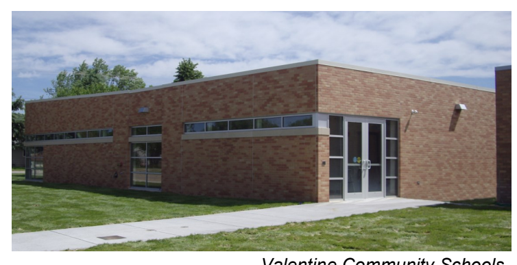
Valentine Community Schools "Having the construction management model involved early in the process allowed for time and cost saving ideas to be incorporated into the final project. Simple changes in materials and construction methods paid off in reducing the overall cost and keeping the project on schedule and within budget." Jamie Isom Superintendent

villages, counties, state colleges, community colleges and school districts now have the opportunity to use Design-Build (D/B) and Management Construction Risk (CM@R) delivery methods well the traditional as as Design-Bid-Build method. These choices allow the subdivisions to choose the delivery method that best meets the needs of each project.