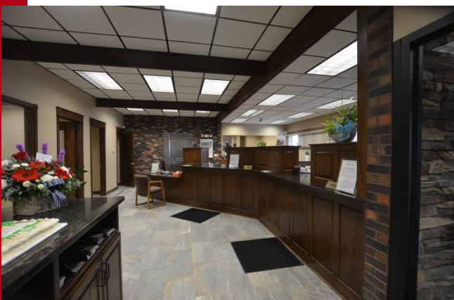
Upper Right: Office Space & Vault Upper Left: Hallway of new addition Lower Left: Teller Area & Offices

It is always rewarding to be called in by a client we have worked for previously and to be invited to complete another project for them, many thanks to Citizens State Bank for putting your trust in Beckenhauer Construction.