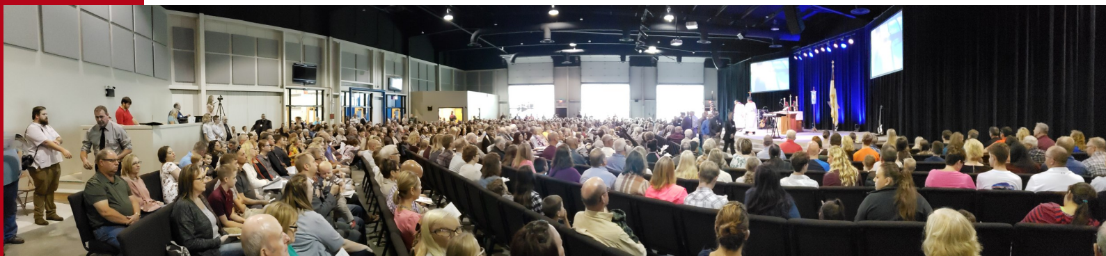
Top Left: Exterior of Facility Top Right: Narthex Bottom: Contemporary Worship Service